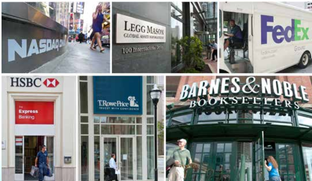
Grayloc Partners Patuxent Capital Consulting

Often, boards and committees take actions on an institution. So instead of showing readers a picture of a boring meeting, show them the institution over which they took action. But don't just show a boring